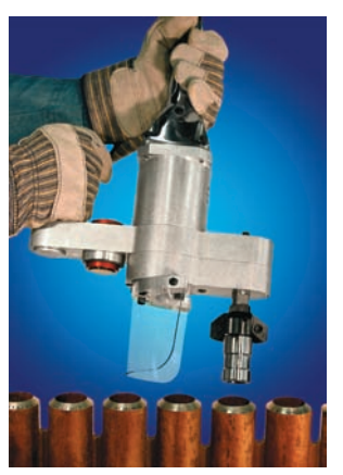
High Speed Hand Held Bevelers prep tubes in seconds, set up is quick and no clamping is necessary.